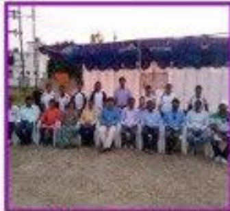
VOLLEYBALL RUNNERUP TEAM 2016 - 17