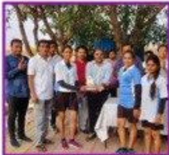
BALL-BADMINTON RUNNER 21-22