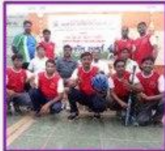
BASEBALL WINNER TEAM 2016-17