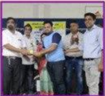
CHESS WINNER 21-22 / 22-23