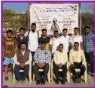
FLOORBALL THIRD PLACE 22-23