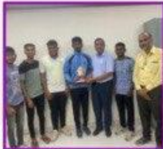
HOCKEY RUNNERUP 22-23