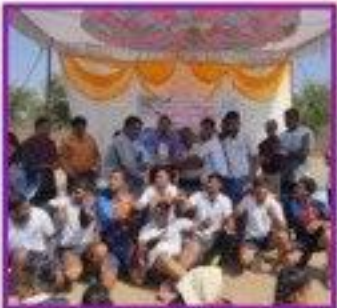
RUGBY WINNER 21-22