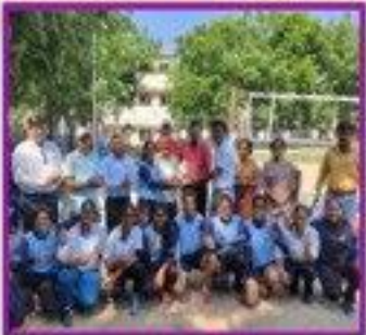
VOLLEYBALL WINNER 22-23