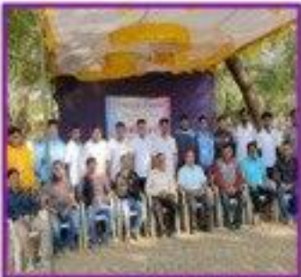
HANDBALL 3RD PLACE 21-22