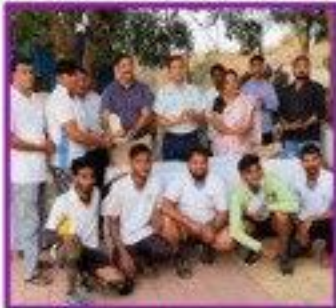
BBM RUNNER 21-22