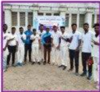
CRICKET TEAM 21-22