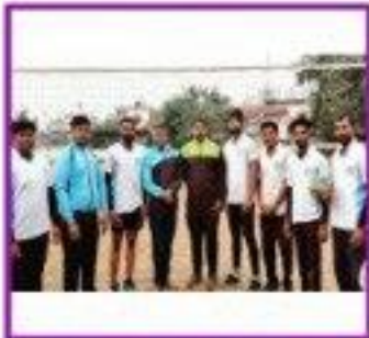
VOLLEYBALL WINNER TEAM 21-22