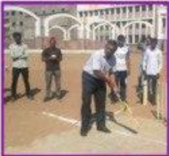
INTRAMURAL COMPETITION OPENING 2019-20