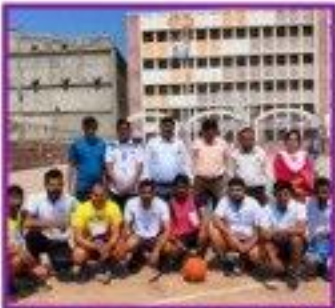
NETBALL WINNER 21-22