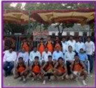
KHO-KHO THIRD PLACE 2016 - 17