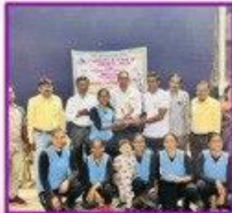
BASKETBALL WINNER 22-23