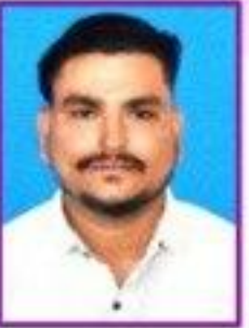
AMARSING GIRASE SOFTBALL