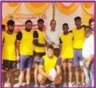
RUGBY WINNER 22-23