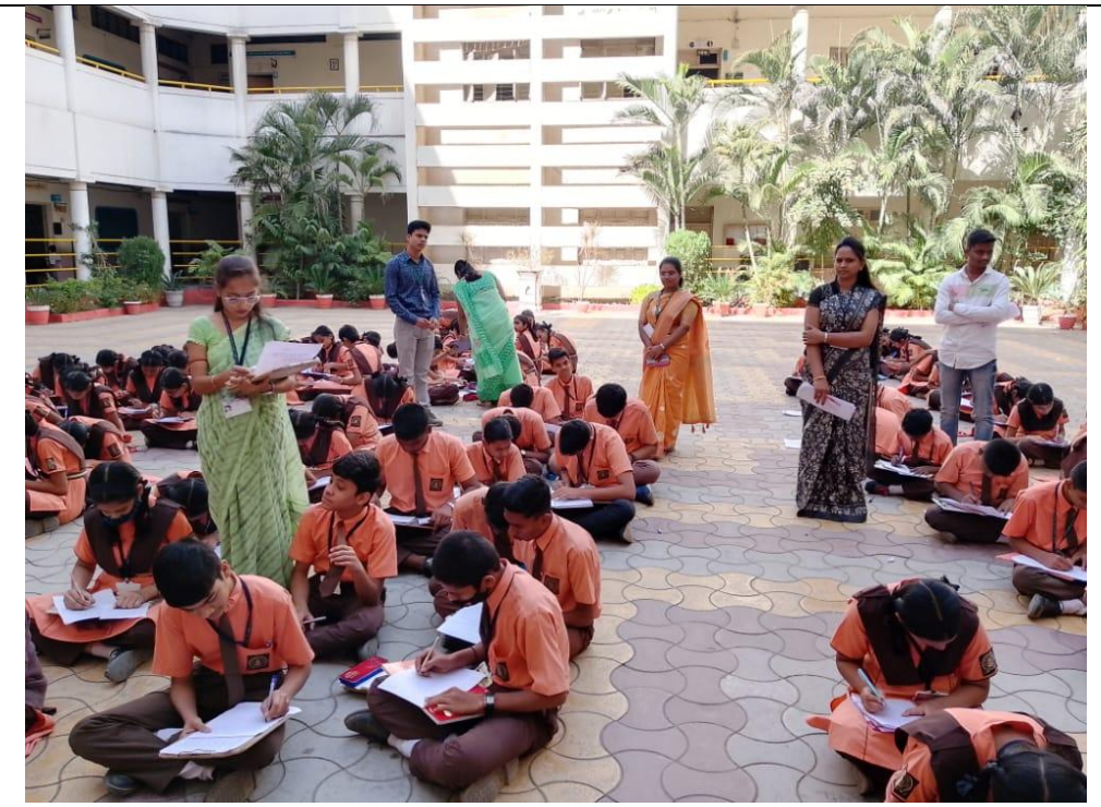
Competition during School Internship program to get Professional Skills and Capacity in our student. 2021-22