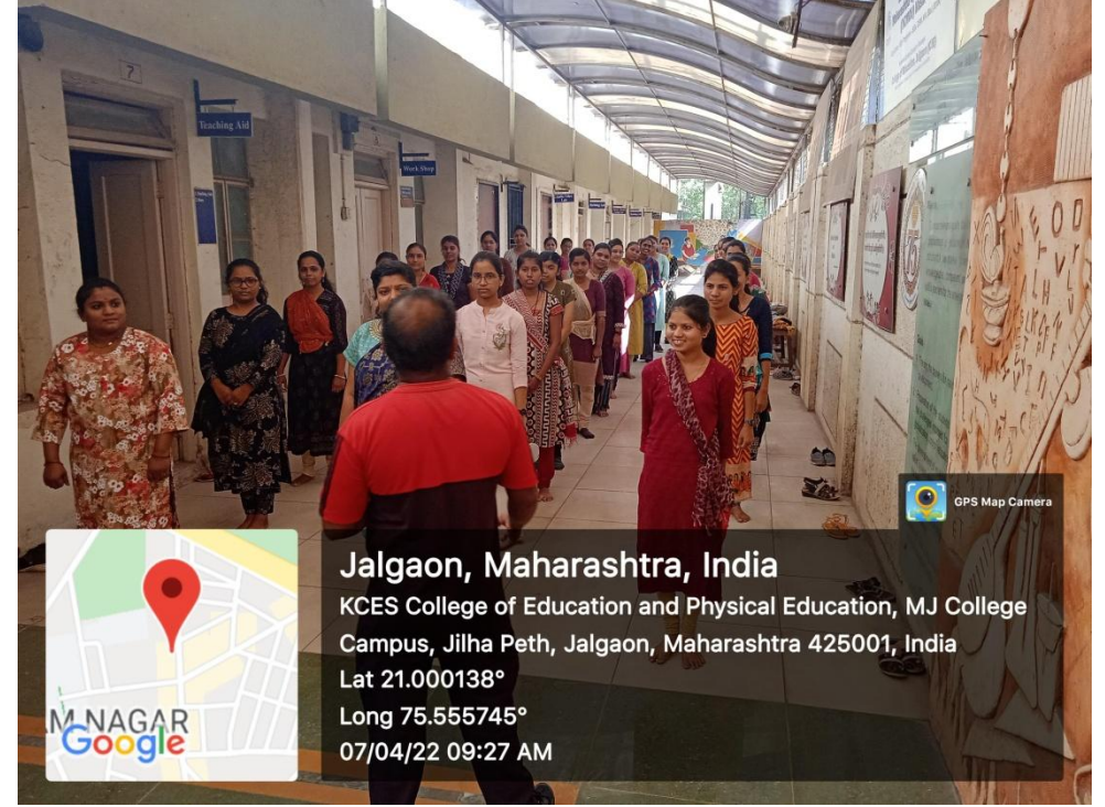
Yuwati Sabha 'Self Defence for Women' 2021-22