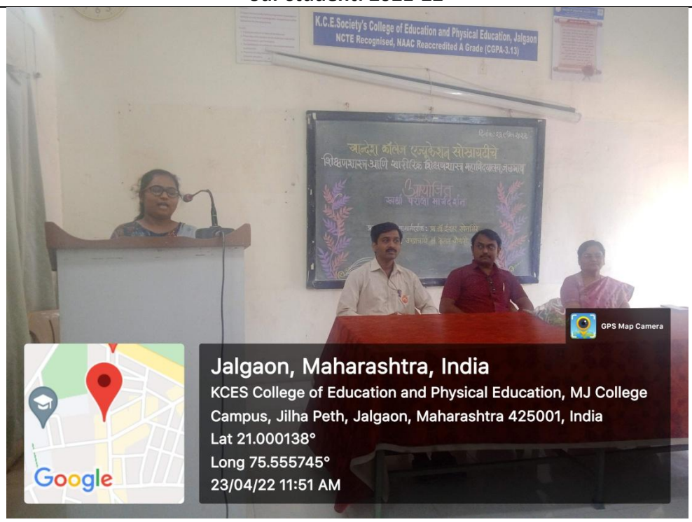
Competattive Exam Guidance 23 April 2022 for Batch B.Ed 2021-22