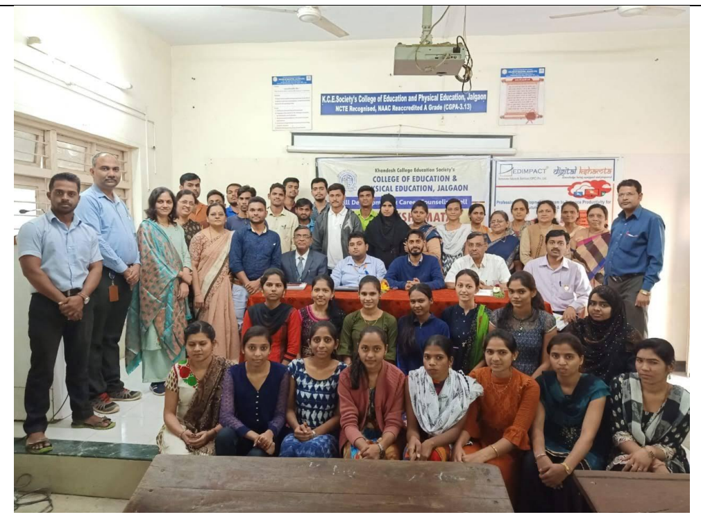
Digital Kshmata Training Workshop Program 13 to 18 th Jan.2020