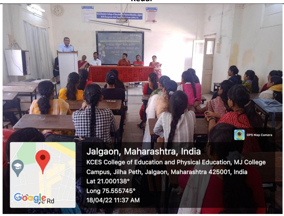
Yuwati sabha, Personality Development Program 18/04/2022