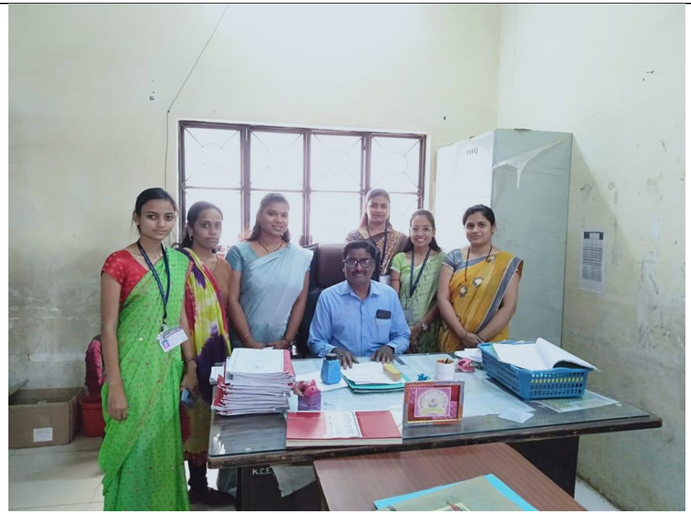
School based Internship to devlop the professional Development (AT Zambre School, Jalgaon) 2021-22