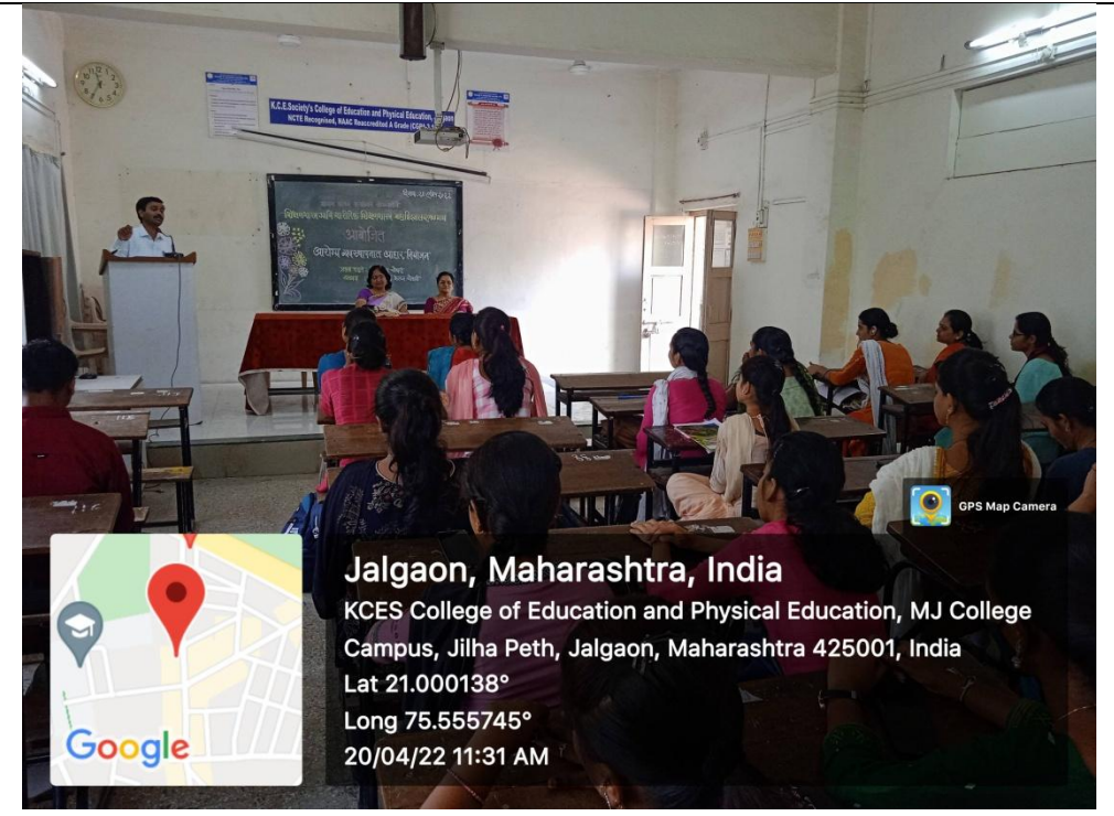
Programme on Health and Nutrition 20/04/2022 for 2021-22 batch