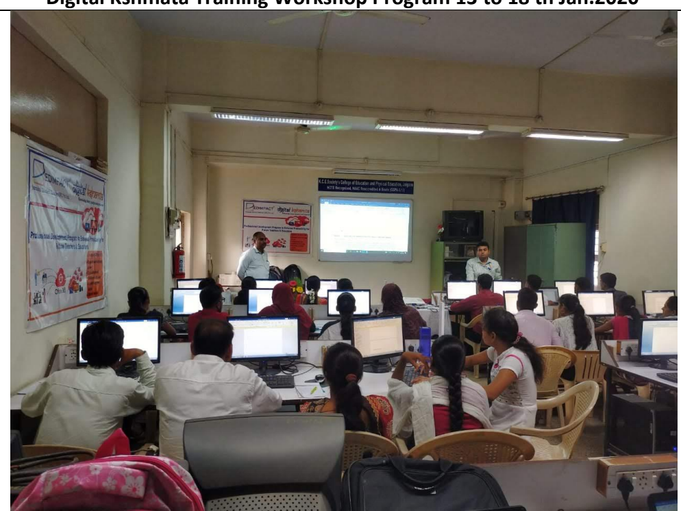
Digital Kshmata Training Workshop Program 13 to 18 th Jan.2020