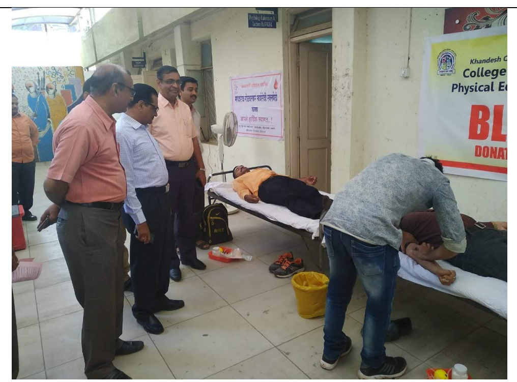
Blood Donation Camp 19/11/2018