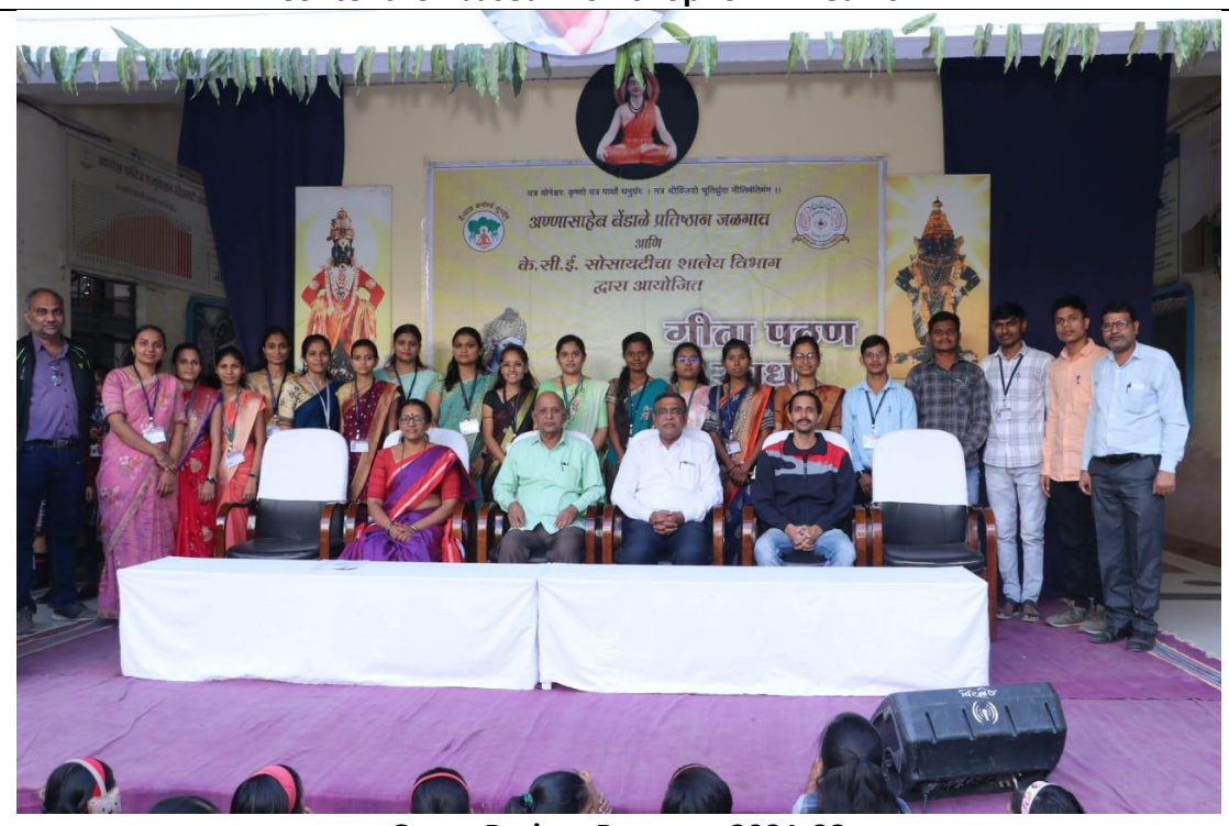
Geeta Pathan Program 2021-22