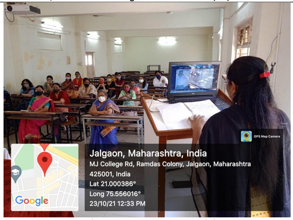
ICT and E content Deveopment Workshop

IQAC and Staff Meeting for various issues04/12/2021