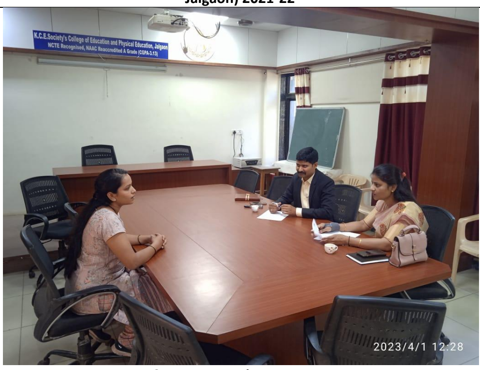
Campus Interview Program