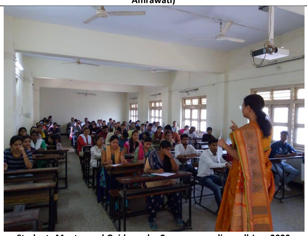
Students Mentor and Guidance by Career counseling cell Jan-2020