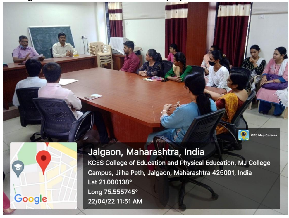
Students Counseling and Grivinance Meeting 2021-22